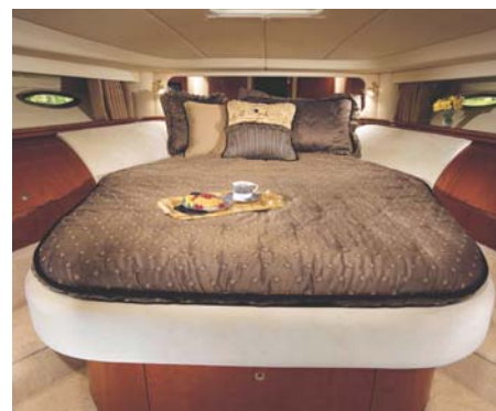
The forward guest stateroom is furnished with a queen-size island bed, underneath which are drawers to stow large, bulky items; a hanging locker; and a color TV/DVD combo.

Sea Ray Boats, 2600 Sea Ray Blvd., Knoxville, TN 37914. For information call 1-800-SRBOATS or fax 1-636-326-3282. Internet address: http://www.searay.com Note: Not all accessories shown in pictures or described herein are standard equipment or even available as options. Options and features are subject to change without notice. Not all model year boats may contain all the features or meet the specifications described herein. Confirm availability of all accessories and equipment with an authorized Sea Ray dealer prior to purchase. Printed in the U.S.A. July 2003 ©Sea Ray Boats.