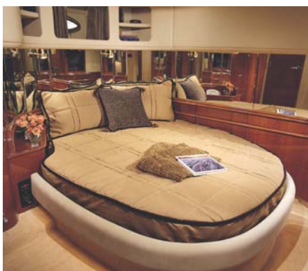
The master stateroom features a queen-size bed with innerspring mattress for ultimate comfort, a full-length hanging locker with mirrored doors, and an entertainment center with color TV LCD flat screen and DVD.

The 550 Sundancer represents the latest in timeless elegance from Sea Ray, inventors and perfecters of the world-famous Sundancer mid-cabin design, and she carries herself with the air of luxury and seaworthiness that is inherent in every Sea Ray yacht.