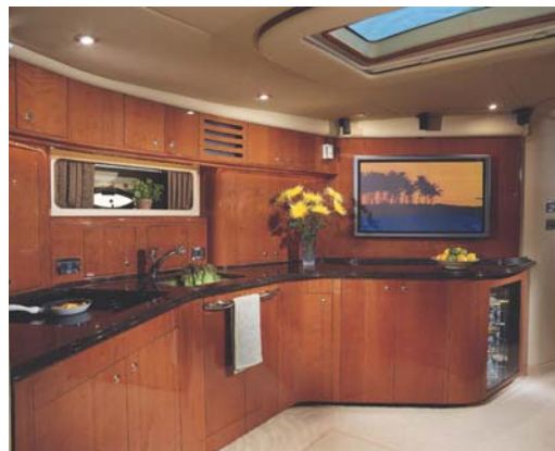
The starboard galley is fully equipped with a refrigerator/freezer with icemaker, recessed three-burner stove and microwave/convection oven, as well as a wealth of storage drawers and cabinets.

The 550 Sundancer represents the latest in timeless elegance from Sea Ray, inventors and perfecters of the world-famous Sundancer mid-cabin design, and she carries herself with the air of luxury and seaworthiness that is inherent in every Sea Ray yacht.