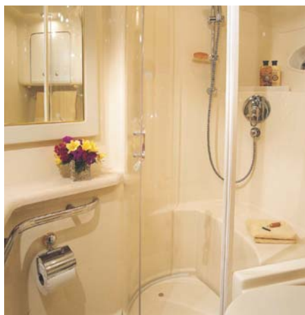
The private master head has a luxurious ceramic tile floor, a vanity with solid surface countertop and sink with Grohe® faucet, a medicine cabinet with mirror, a circular shower with seat and adjustable shower wand, and a VacuFlush® toilet.