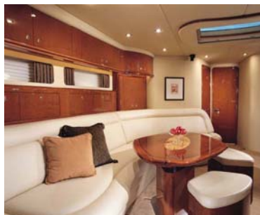
In the salon, an entertainment center with stereo, DVD and a television with 42" flat plasma screen issues an invitation to relax.