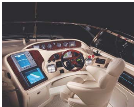
At the helm station, a custom swivel captain's seat overlooks the burl control panel with custom backlit instrumentation and a wood-accent tilt steering wheel.